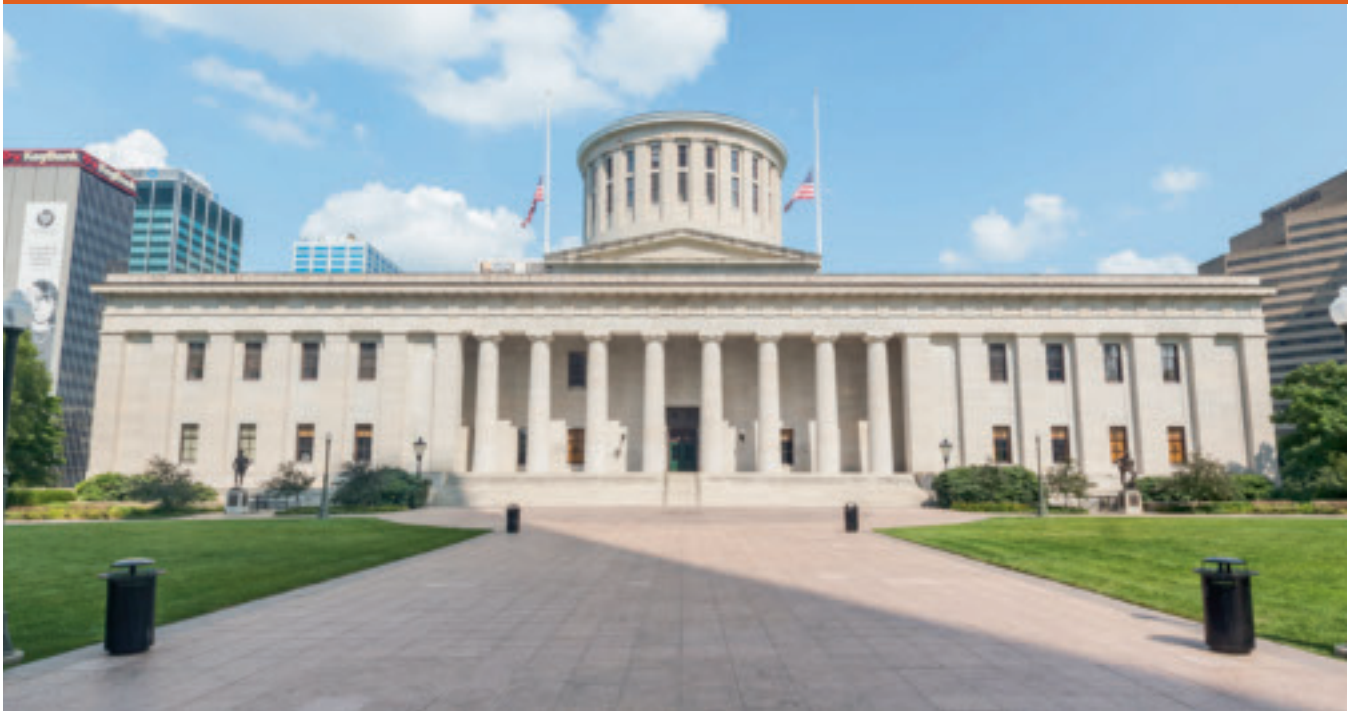
OHIO STATEHOUSE